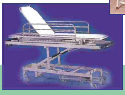
Emergency & Recovery Trolley