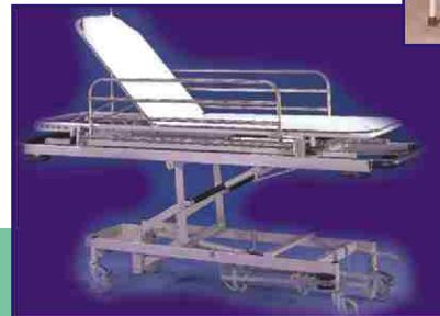
Emergency & Recovery Trolley